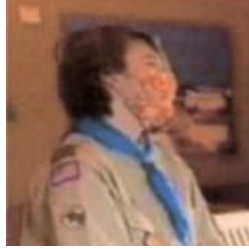
Caroline Bronte Troop 224G